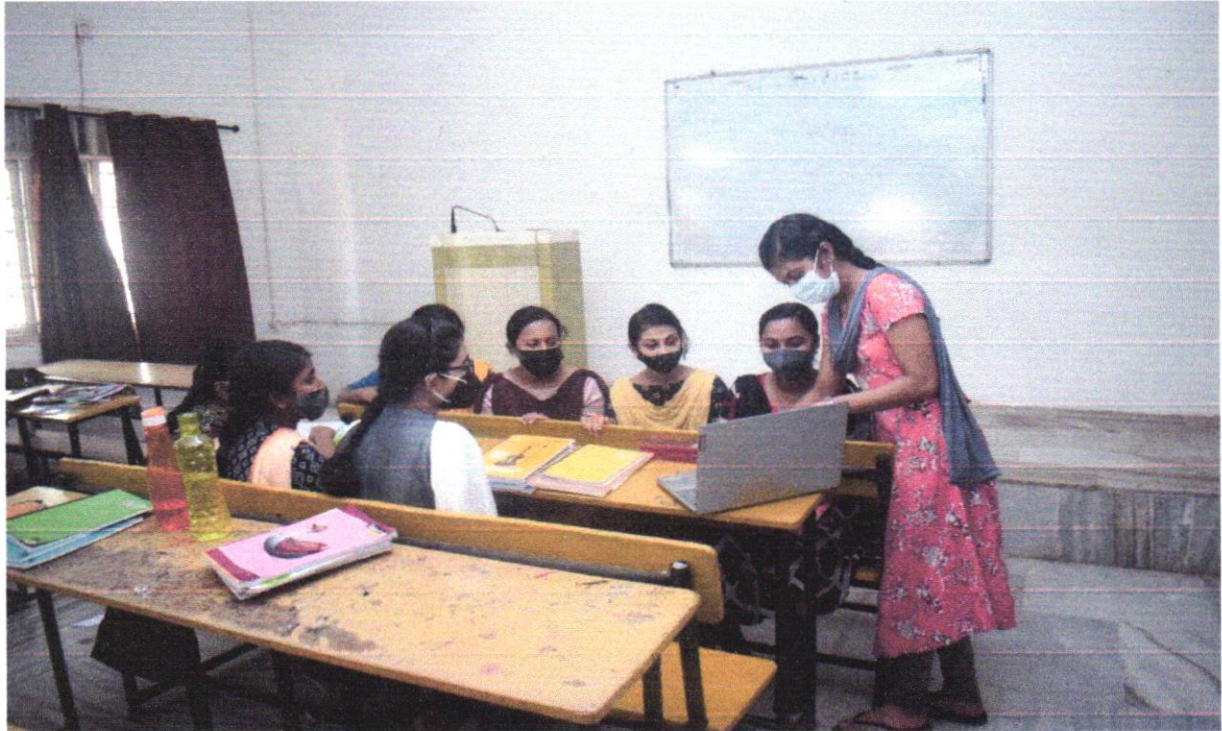
Pic-3- Discussion among students related to topic