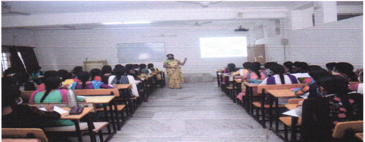
Pic-1- Playing video of topic in class and sharing the same video to students