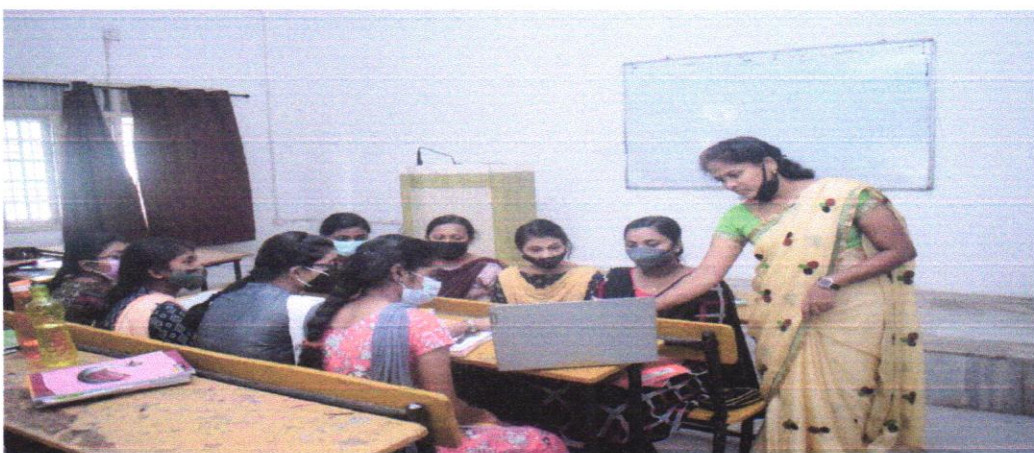
Pic-2- Grouping students and explain the content which was played in video